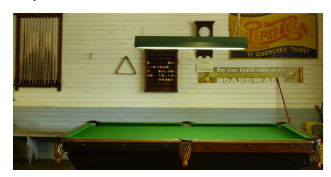
Vilna's Historic Pool Hall

Village of Waskatenau: 780-358-2208 www.waskatenau.ca