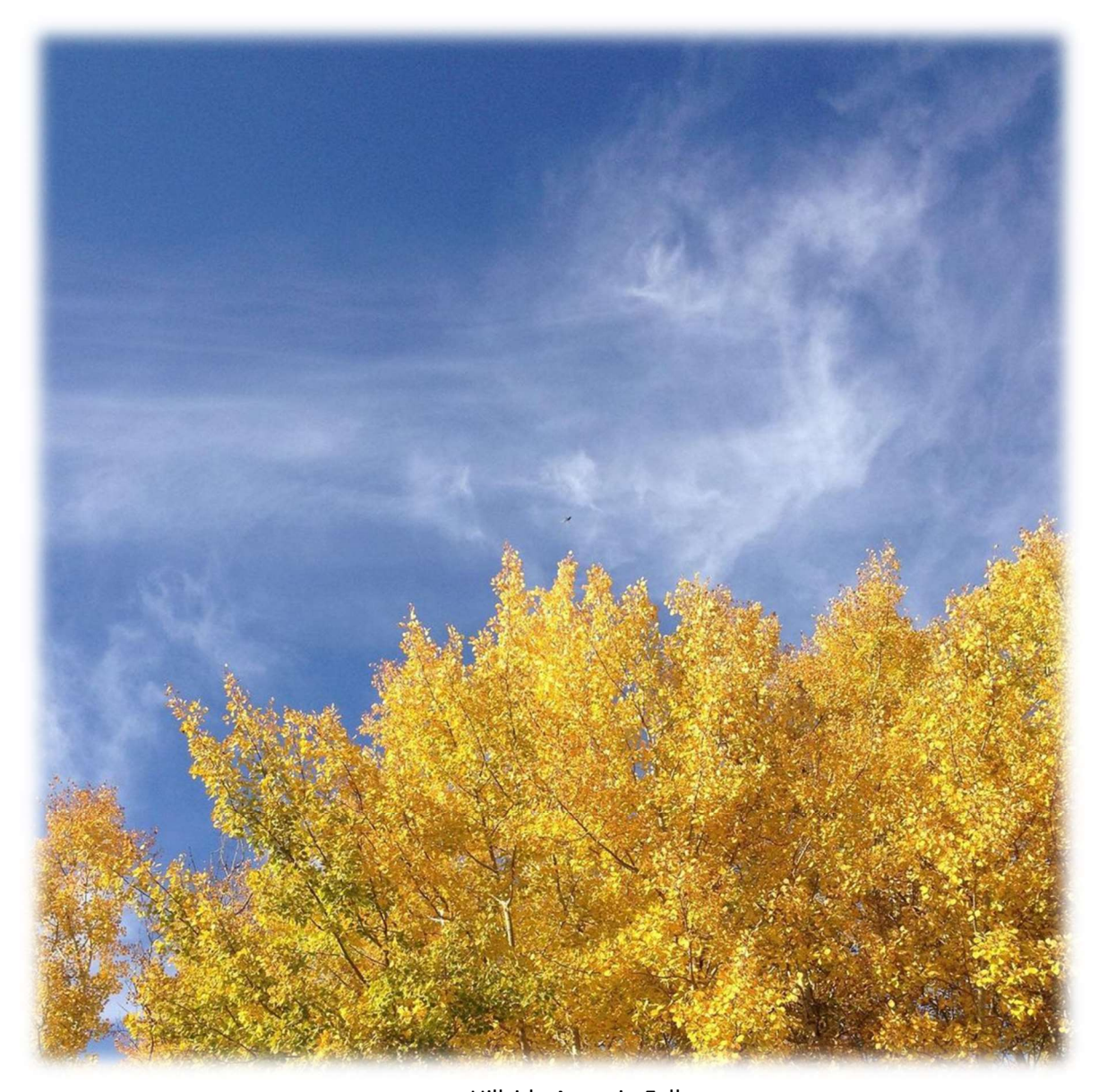
Hillside Acres in Fall