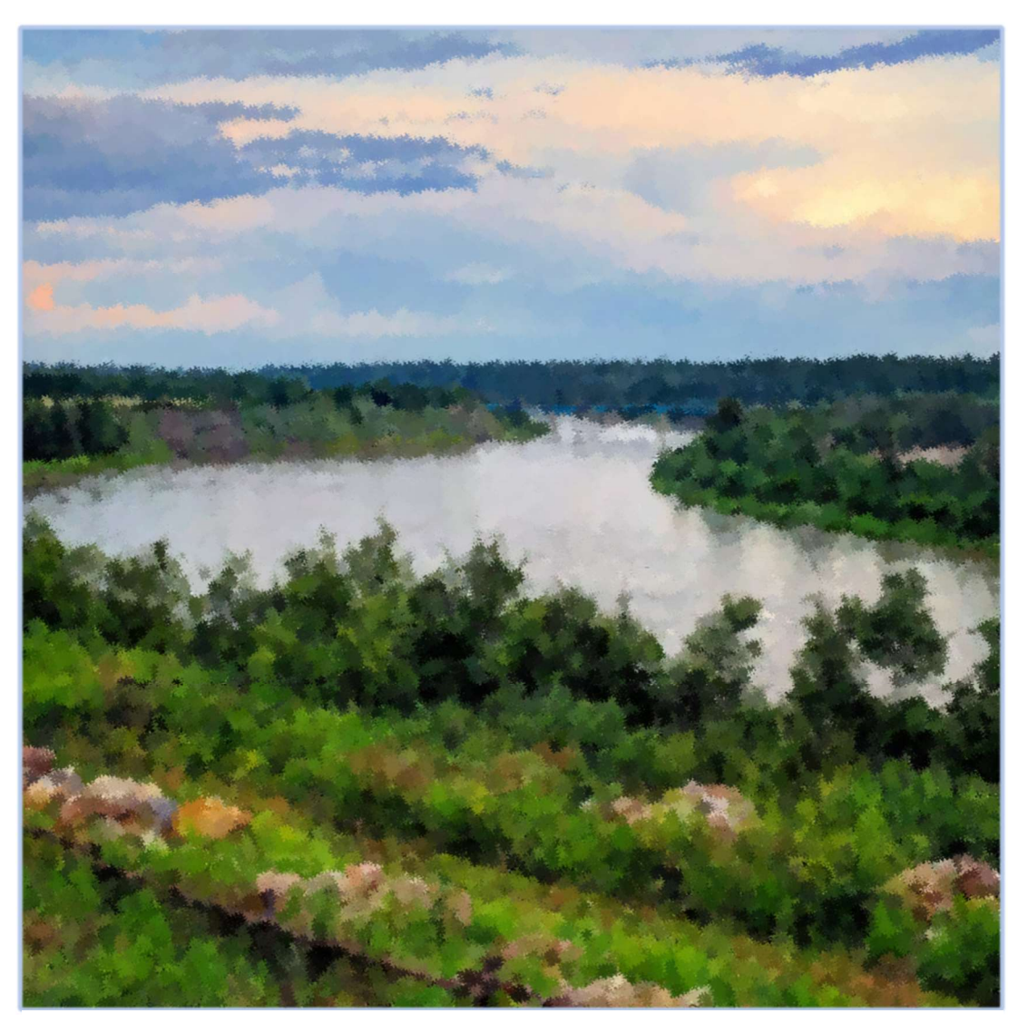
Looking east on the North Sask. River, at 'the Elbow'