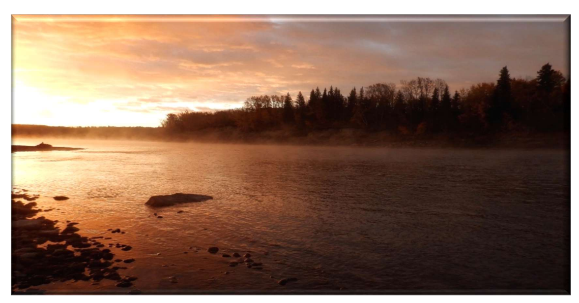
Sunrise on the NSR, Ceyana Canoe Club, 2021

The strategic plan forms the basis of the financial plan as it sets out what the municipality wants to do in the short-term (1 to 3 years) and longer terms (5-10 years). The financial plan determines the anticipated costs to accomplish the priorities of the strategic plan and consequently the extent to which a priority can reasonably be accomplished. The two plans are inseparably intertwined and for this reason, the strategic plan always precedes and is relied upon in the preparation of the budget priorities because the MGA requires municipalities to prepare mandatory three-year operating and five-year capital plans.