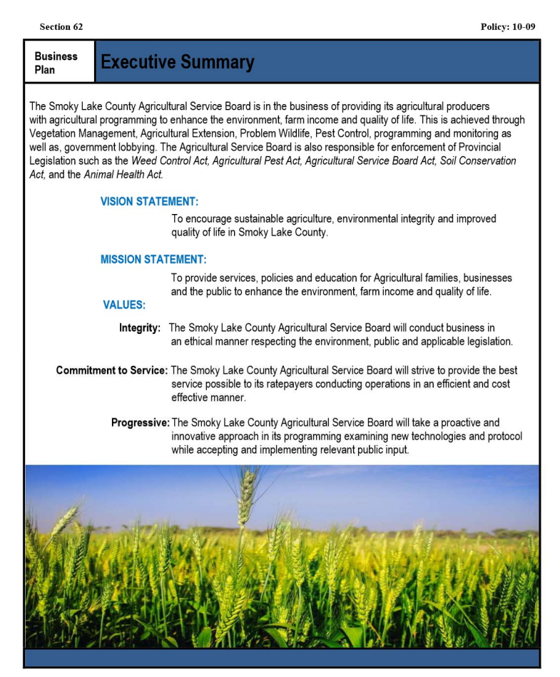
Agricultural Service Board: Business Plan 2024